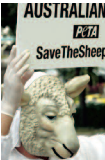
An activist for the People for the Ethical Treatment of Animals (PETA) holds up a sign decrying the abuse of sheep by Australian wool exporters and calling for a boycott of Australian wool. November 4, 2004.

“We are told legislation to protect journalists is coming, but will it really make a lot of difference?”