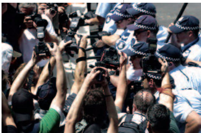
Protestors and police clash as the media look on at anti-globalisation demonstrations near the G20 venue in Melbourne. November 18, 2006.