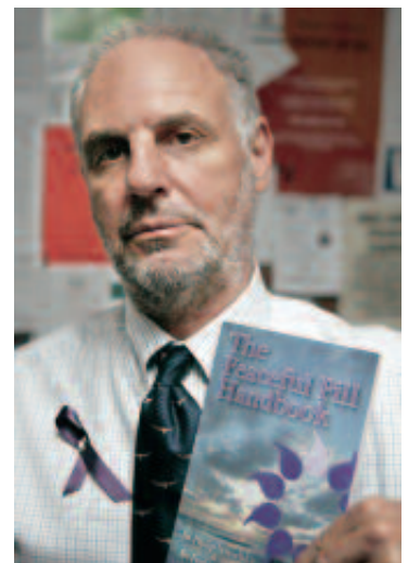
Voluntary Euthanasia advocate Phillip Nitschke holds a copy of his latest book. September 22, 2006.

“The continued attacks on the advocacy work of critical NGOs paint a bleak picture of the state of public debate in Australia. Many NGOs are reluctant, if not afraid, to speak out.”