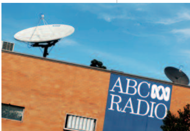
The ABC headquarters in Brisbane, following the announcement of an independent inquiry into cancer at the site. July 13, 2006.