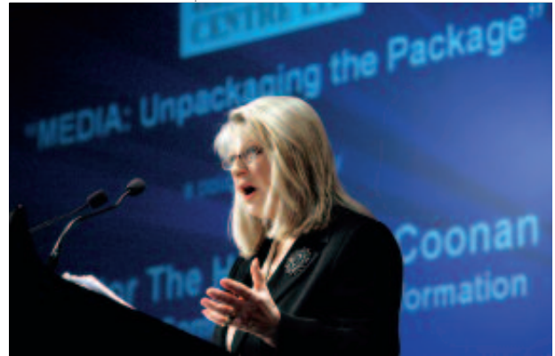
Senator Helen Coonan delivering her speech, Media: Unpacking the Package, to the Menzies Research Centre, Sydney. August 4, 2006.

When the Howard government last tried to change the cross-media laws in 2003, Paul Keating – architect of the 1987 laws - warned it would be naive to assume that expanded news groups such as News Ltd would not use newly-acquired television stations as “political